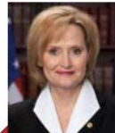
Junior Senator Cindy Hyde-Smith

The Honorable Roger Wicker 555 Dirksen Senate Office Building Washington DC 20510 (202) 224-6253 Fax: (202) 228-0378 email: http://www.wicker.senate.gov