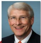
Senior Senator Roger Wicker

The Honorable Roger Wicker 555 Dirksen Senate Office Building Washington DC 20510 (202) 224-6253 Fax: (202) 228-0378 email: http://www.wicker.senate.gov