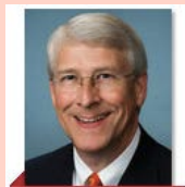
Senior Senator Roger Wicker

The Honorable Roger Wicker 555 Dirksen Senate Office Building Washington DC 20510 202.224.6253 Fax: 202.228.0378 email: http://www.wicker.senate.gov