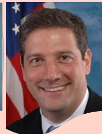
Lindsey Graham (R-SC)