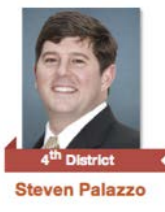
4 th District Steven Palazzo

Brandon Office 308 B East Government Street Brandon, MS 39042 Phone: 769.241.6120