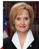
Junior Senator Cindy Hyde-Smith

Gulfport Office 2909 13th St 3rd Floor, Ste 303 Gulfport, MS 39501 228.871.7017 228.871.7196 Fax