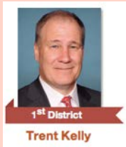
1 st District Trent Kelly

Washington, D.C. The Honorable Trent Kelly 2243 Rayburn House Office Building Washington, D.C. 202.225.4306 202.225.3549 Fax https://trentkelly.house.gov/