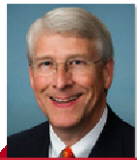
Senior Senator Roger Wicker

The Honorable Roger Wicker 555 Dirksen Senate Office Building Washington DC 20510 (202) 224-6253 Fax: (202) 228-0378 www.wicker.senate.gov/public/index.cfm/contact