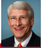
Senior Senator Roger Wicker

The Honorable Roger Wicker 555 Dirksen Senate Office Building Washington DC 20510 (202) 224-6253 Fax: (202) 228-0378 www.wicker.senate.gov/public/index.cfm/contact